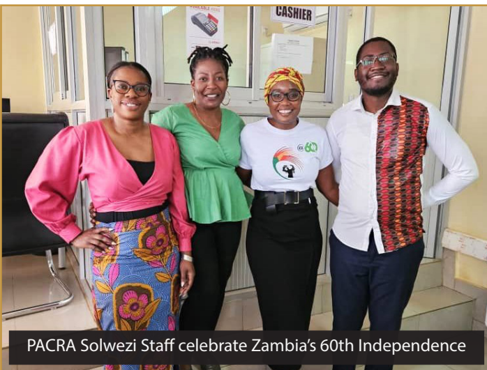
PACRA Solwezi Staff celebrate Zambia's 60th Independence