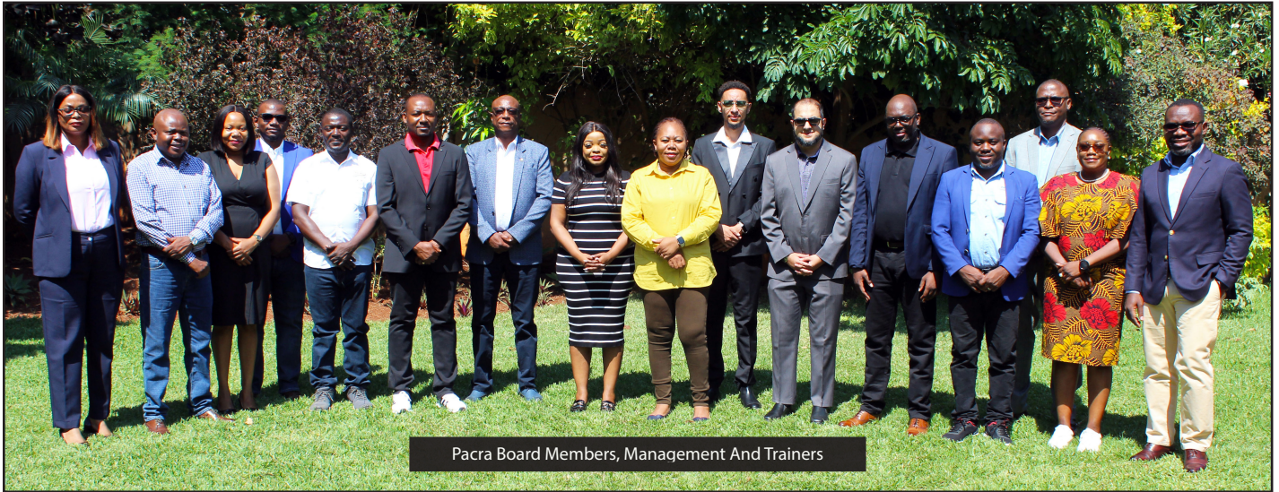
Pacra Board Members, Management And Trainers

The PACRA Board on Saturday 7th December 2024 underwent a Risk Management Training aimed at equipping the members with the knowledge, skills, and strategies necessary to effectively identify, assess, and manage risks.