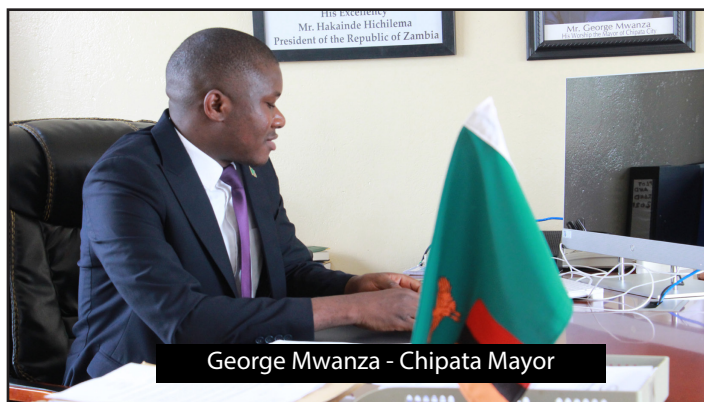
George Mwanza - Chipata Mayor

Mr. MWANZA says the move is part of promoting formalization of businesses in the district and increase revenue for government’s development agenda.