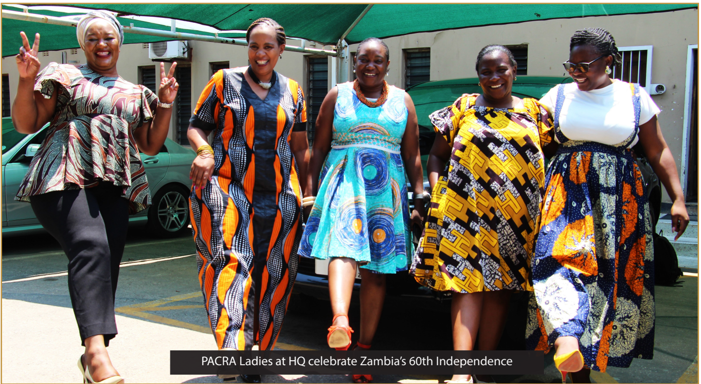
PACRA Ladies at HQ celebrate Zambia's 60th Independence