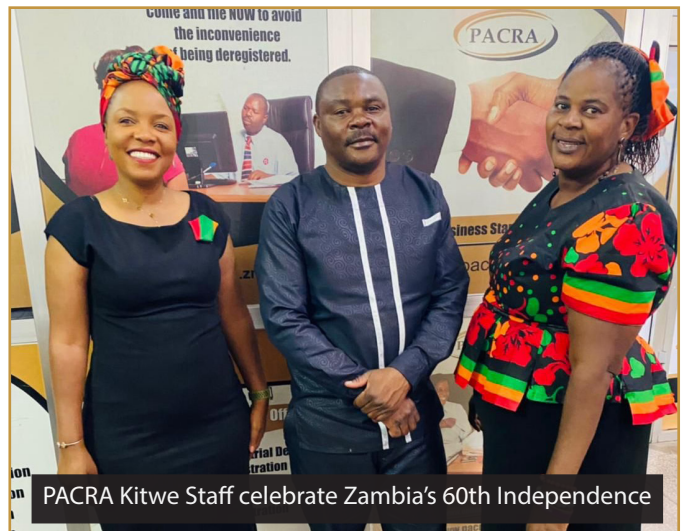
PACRA Kitwe Staff celebrate Zambia's 60th Independence